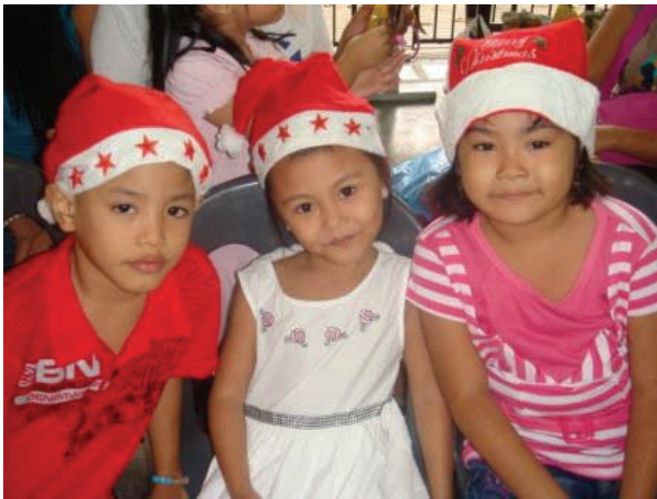
Beneficiaries of our Sponsorship Program during the Christmas Party.