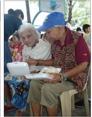
Our visitors from Golden Acres Elderly Home

After the celebration of the mass, an array number of songs, dances, other presentations as well as games and raffles made the day special and animated.