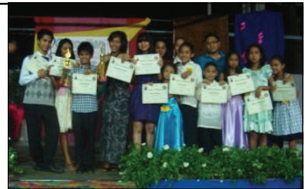
Participants of the Singing Contest 2009