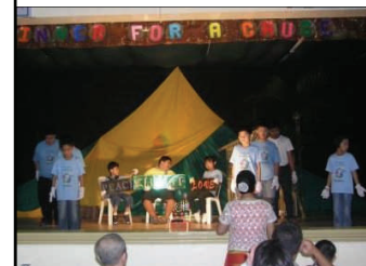
Special children performing during the event.

A program, prior to the dinner proper, showcased the rich and colorful Bicol heritage and was presented by staffs and various groups that were recipients of the Guanellian ministries in Legazpi City including the shelter home residents, the youth and the special children.