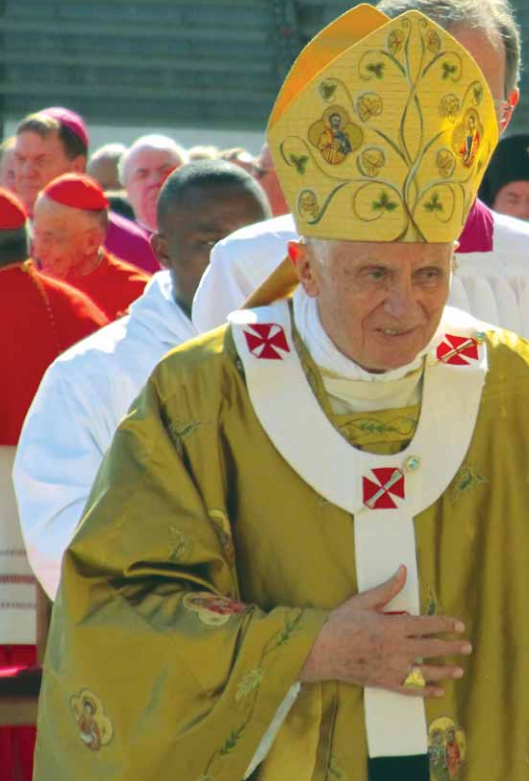
Pope Benedict XVI during the Canonization of St. Louis Guanella – October 23, 2011