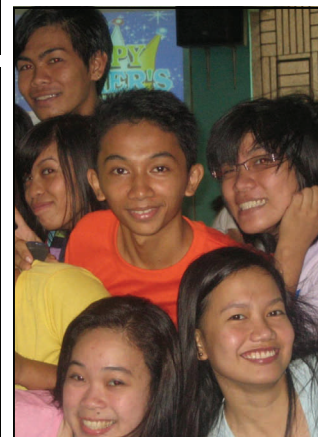
Our Guanellian Youth after the Induction of their New Elected Officers of GYM Core Group